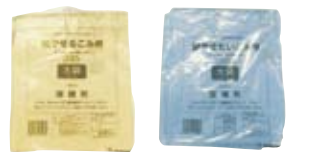
Designated combustible waste bag: Cream color Designated incombustible waste bag: Light blue color